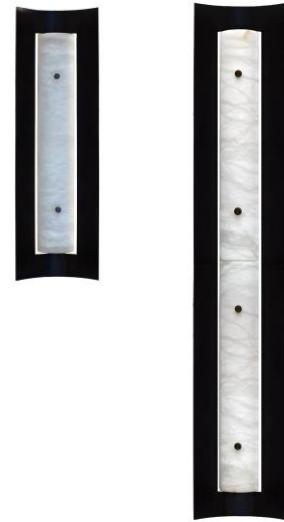
TALLIS WALL LIGHT